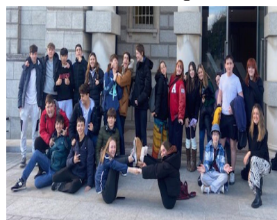
Art Gallery/Museum Trip