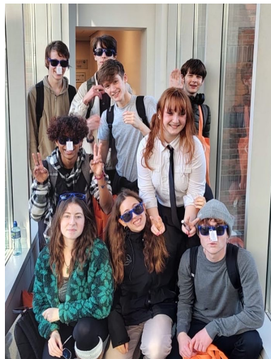
Our DCU Trip

TY students had their first overnight trip of the year to Carlingford Adventure in September. Students participated in survivor and team building activities, such as raft building. They spent the few days getting to know each other and developing communication and team work skills, students were pushed out of their comfort zone and asked to put their full trust in each other as they navigated an obstacle course together; blindfolded! They also did some pier jumping, kayaking, a laser tag course, dodge ball archery and rock-climbing in the mountains. It was great to see many students challenging themselves, trying something new and supporting each other.